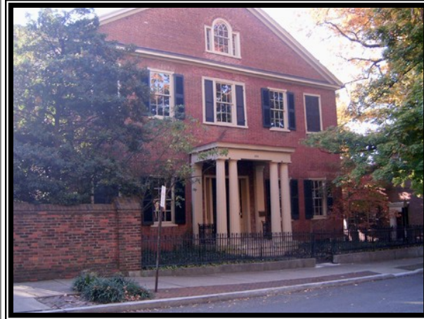
Bodley-Bullock House 200 Market Street Lexington, KY

Several interior designers will decorate the exterior and interior of the home for the holidays. Special group tours are available. Many holiday items will be available for the public to purchase. Mr. & Mrs. Claus will also be there! Tours: November 20—December 2, 2009 Tuesday—Thursday: 11 a.m.—4 p.m. Friday: 11 a.m.—5 p.m. Saturday & Sunday: 1 p.m.—5 p.m. The house will be closed for tours on Mondays and Thanksgiving Day. General Admission: $10 per person